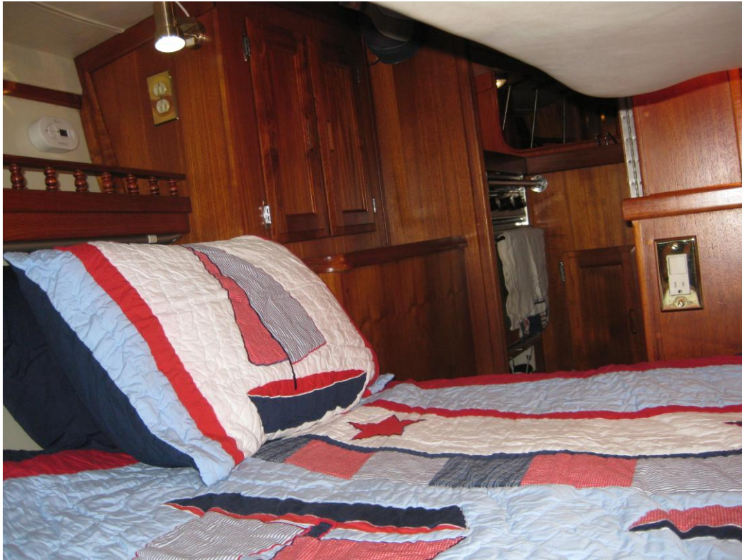
Aft double berth looking forward to galley