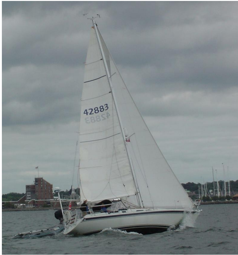
1988 Ericson 32-200, Luna