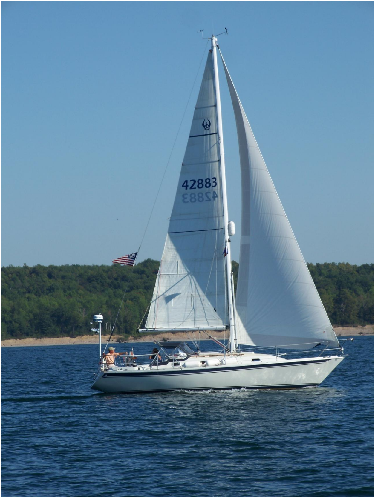
Luna sailing on Lake Ontario near Little Sodus Bay