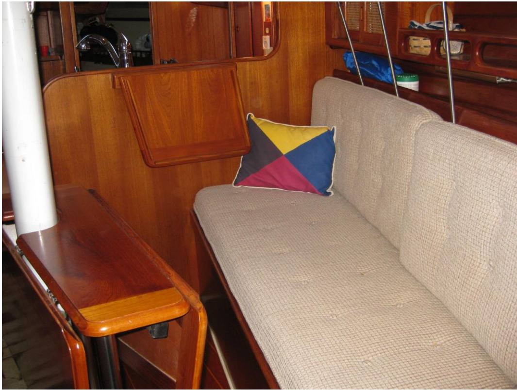
Looking aft on port side, note custom swing down shelf on bulkhead – fantastic help when working in the galley.