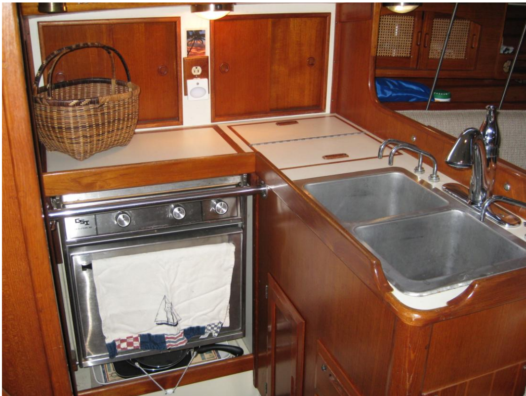
Galley to port at base of companionway stairs