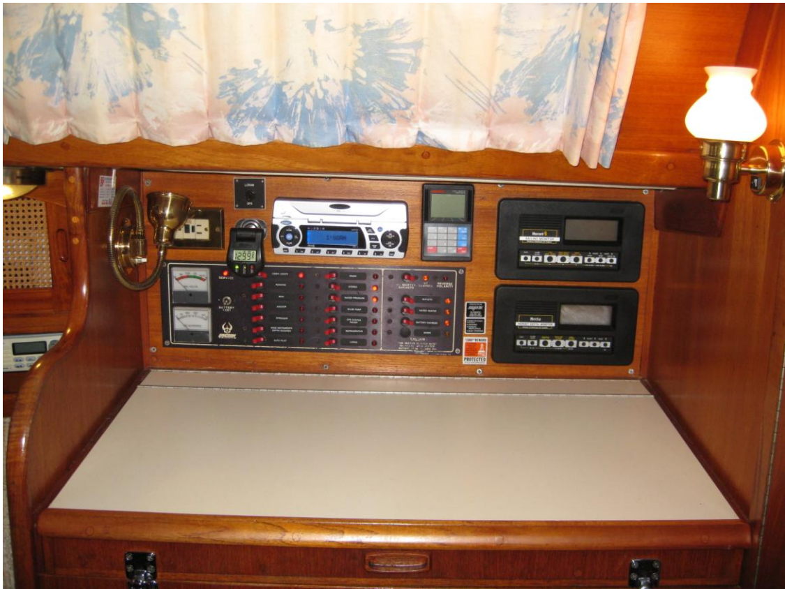
Nav Station with ice box below