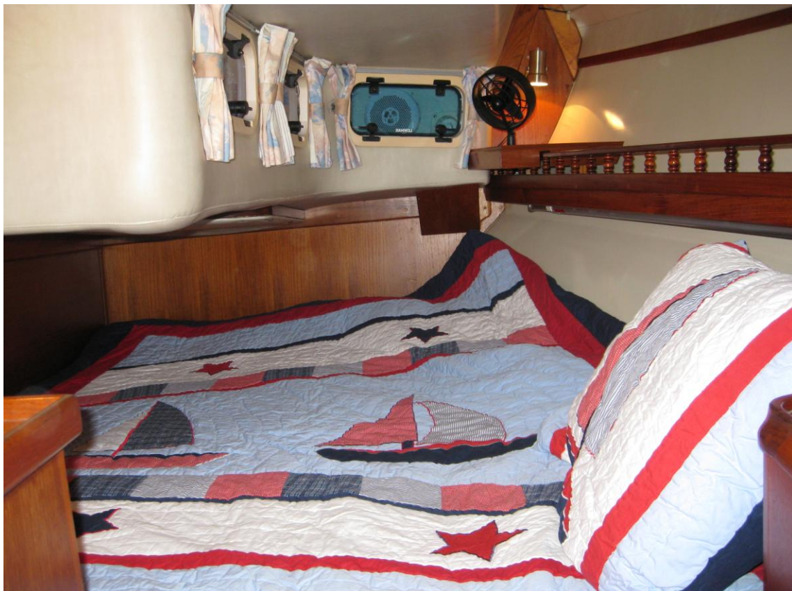
Aft Quarters, double berth