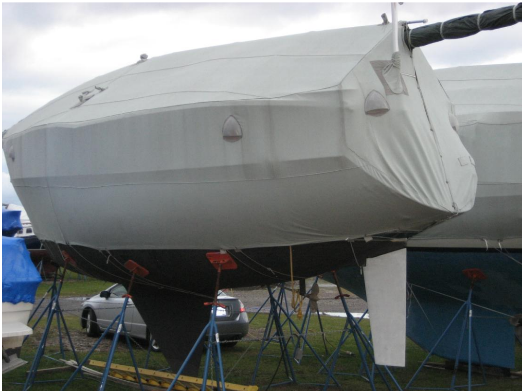
Full Fairclough canvas cover can accommodate mast up storage also. It's almost as good as indoor storage. Zippered doorway on starboard side at lifeline opening make access extremely easy with cover in place.