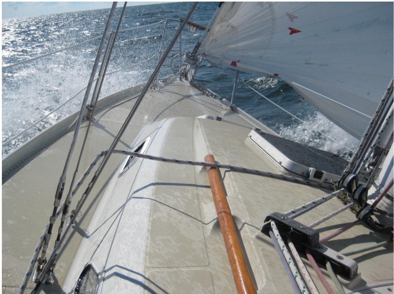
Luna sailing around Point Peninsula headed toward Cape Vincent, NY, June 2012