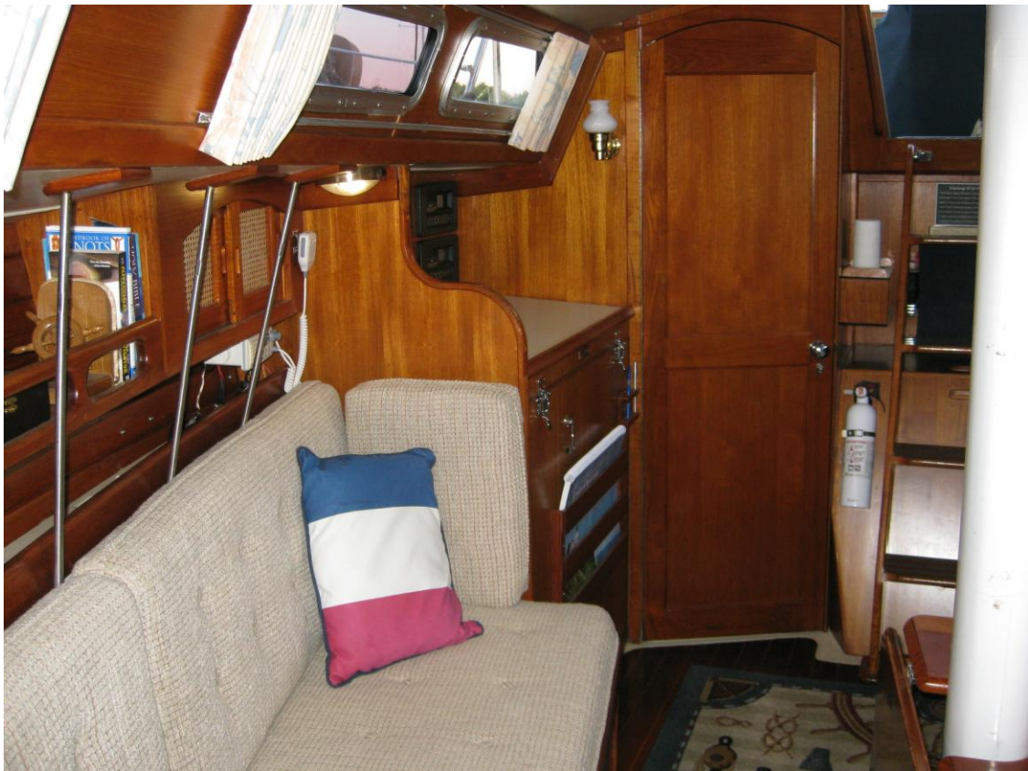
Looking aft on starboard side, head located behind door