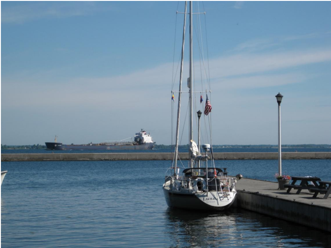
Luna at the Cape Vincent, NY municipal dock after a fantastic day of sailing, June 2012