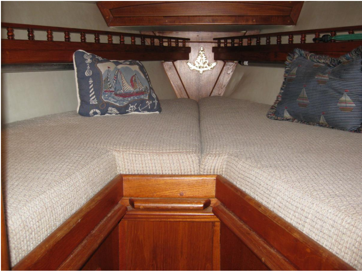
Double V -Berth